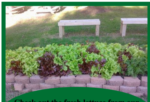
Check out the fresh lettuce from our new vegetable garden!

Join us for the January PTO Meeting on Tuesday, 1/17, 9:30AM, SPA Room